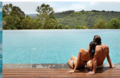
GWINGANNA RESORT. ENVIROSWIM POOL SINCE 2010